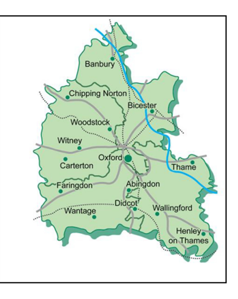
Figure 1: Oxfordshire Study Area (OCC 2014a)

The study area comprises the entire county of Oxfordshire (see Figure 1), which is located in the south east of England. The county comprises the districts of Oxford, Cherwell, Vale of White Horse, West Oxfordshire and South Oxfordshire.